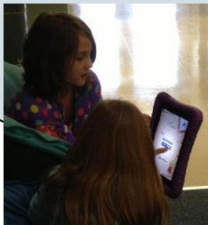
EKD Students Creating Collaborative Stories on their iPads